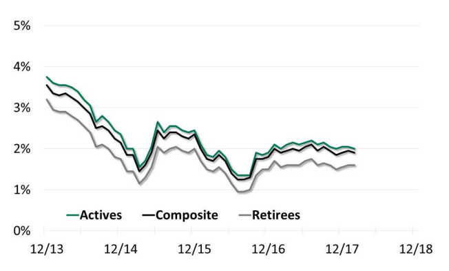
Historical Discount Rates

The discount rate development of the past four years is shown in the following chart: