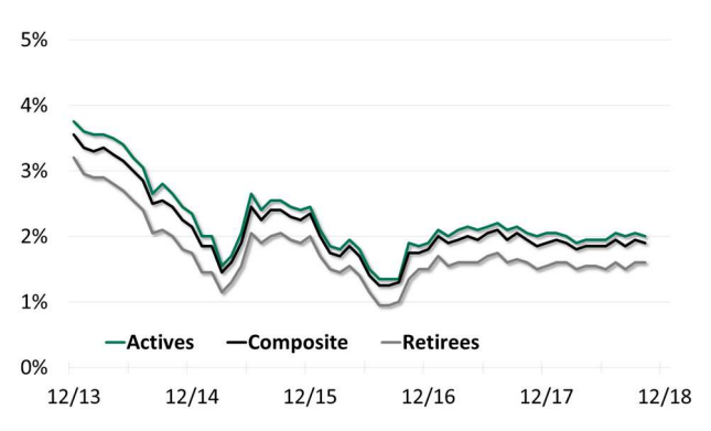
Historical Discount Rates

The discount rate development of the past four years is shown in the following chart: